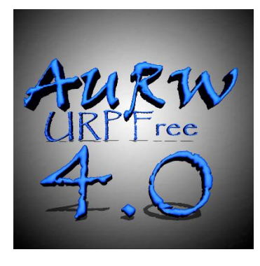
Figure 1 A.U.R.W. Logo

This is A.U.R.W. URP Free Version 4.0 in next title you are going to see the change log. This will be our last update in a long time.